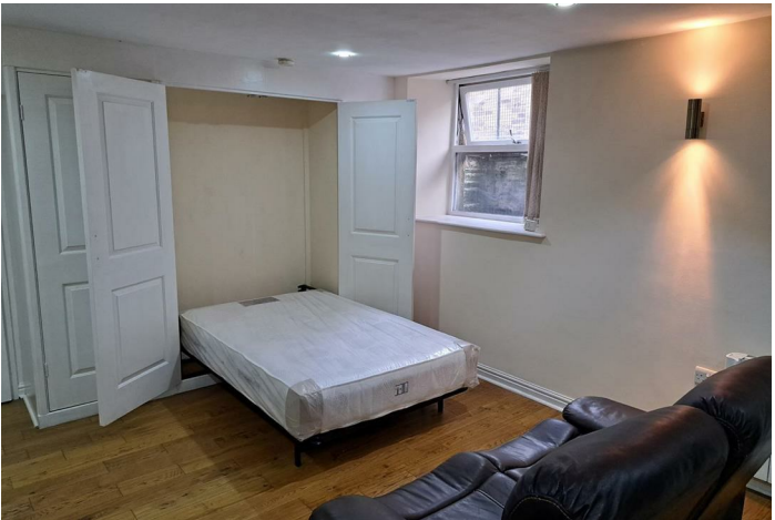
Studio (EPC Rating: C)